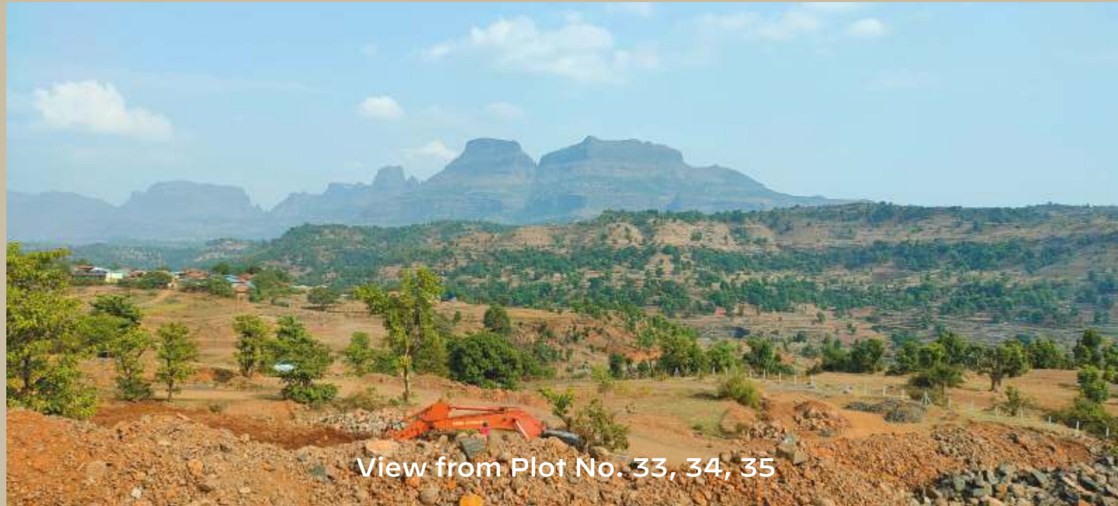
View from Plot No. 33, 34, 35