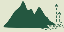
1660 ft. from Sea Level