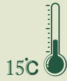
15°C Temperature Min. 15°C Max. 35°C