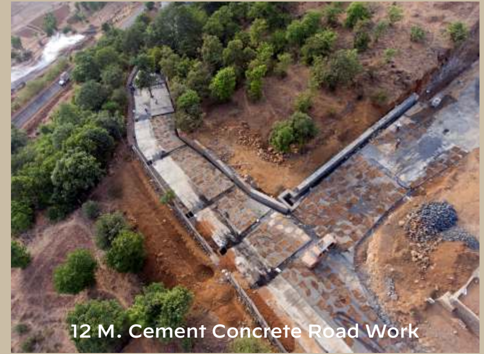
12 M. Cement Concrete Road Work