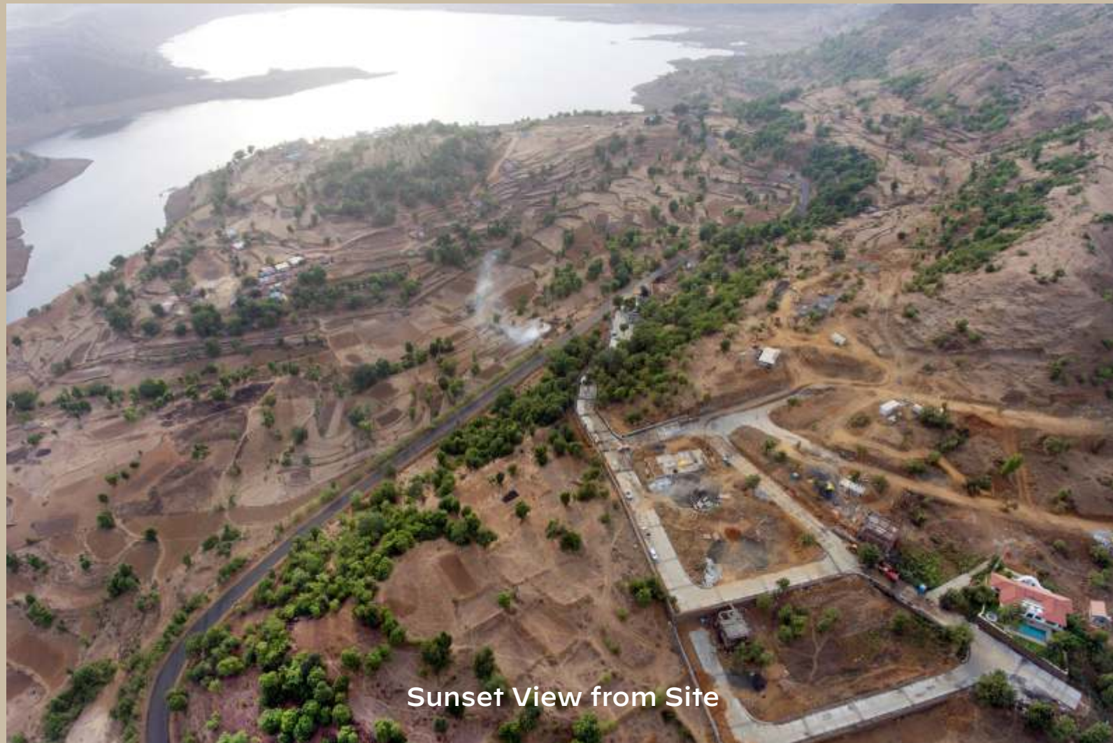
Sunset View from Site